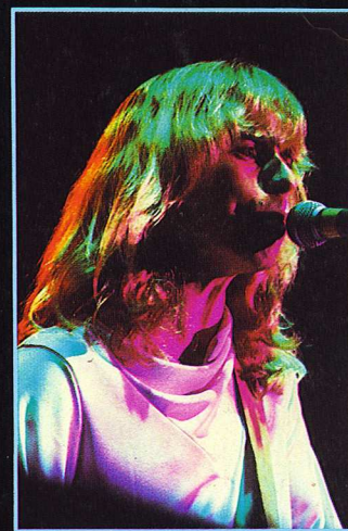
TOMMY SHAW Acoustic, Electric and 12 String Guitars and Vocals.